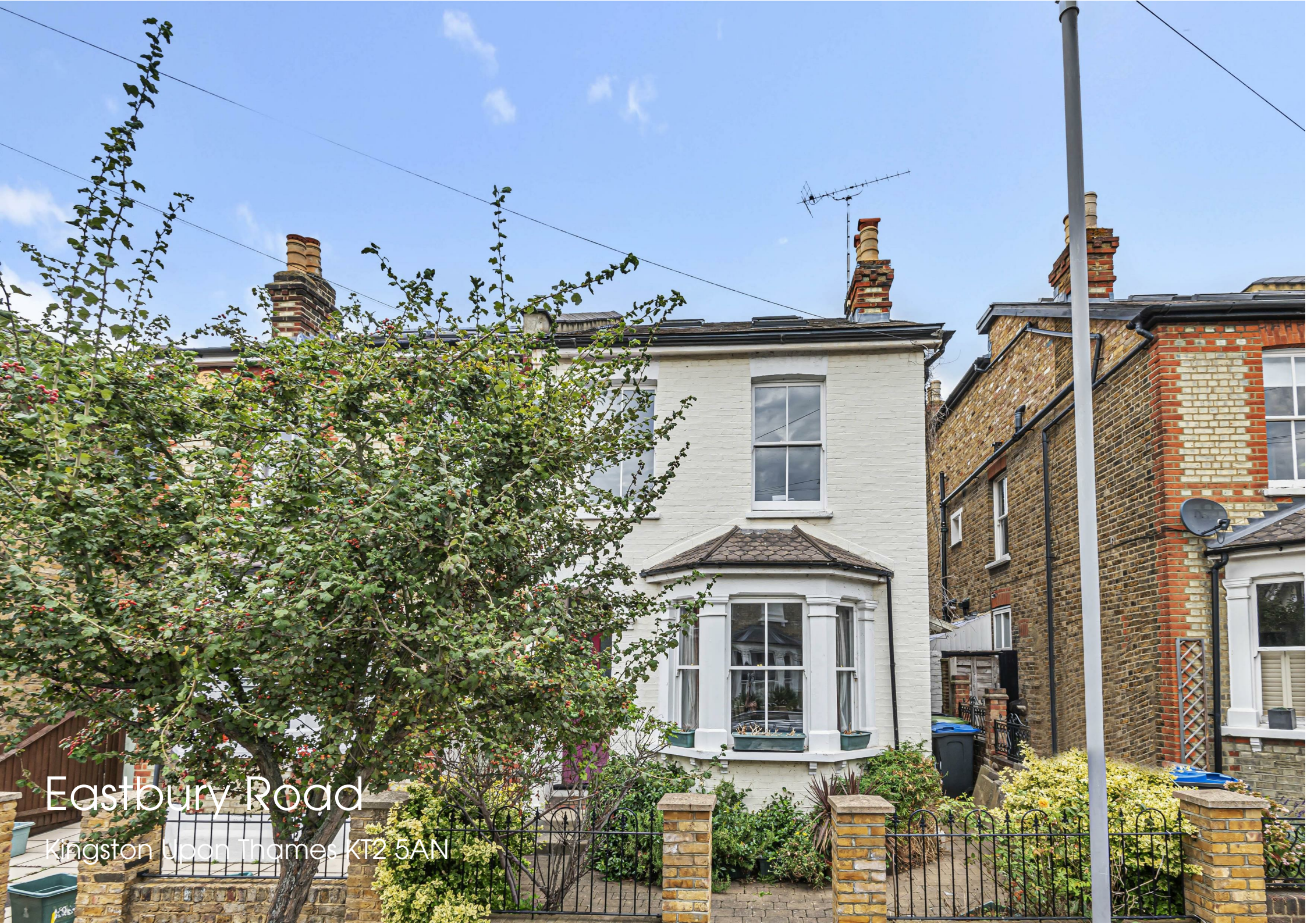
Eastbury Road Kingston upon Thames KT2 5AN

34 Richmond Road Kingston upon Thames Surrey KT2 5ED www.gibsonlane.co.uk Tel: 020 8546 5444